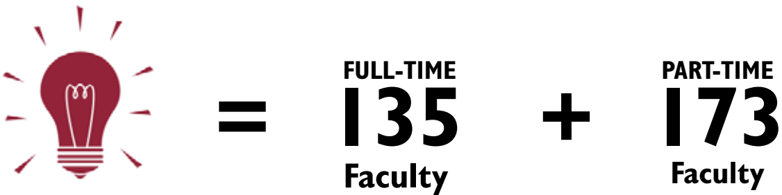
Development solutions distribution

of external faculty and experts to ensure we always have the right instructor for any topic