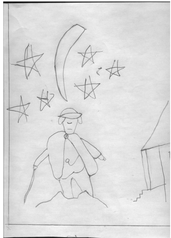
Figure, Moon and Stars , Jamie Wyeth, 6 years, J. Wyeth archives, CF11.065