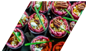
Food & Drinks