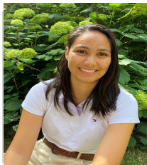
Katherina Grey Nuns