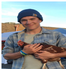
Ben Grey Nuns