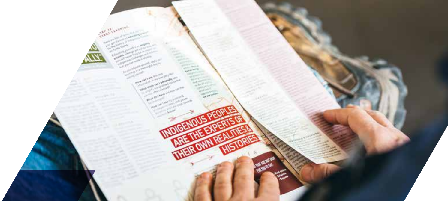
A participant at the Internal Launch of the Action Plan reads the Indigenous Ally Toolkit created by the Montreal Urban Aboriginal Community Strategy Network, reseauumtlnetwork.com/resources/ (2019)