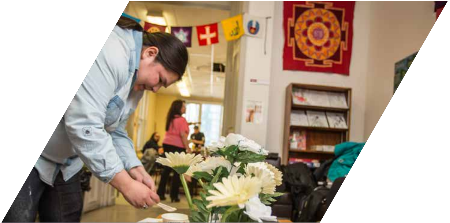
Students gather in the Multi-faith and Spirituality Centre