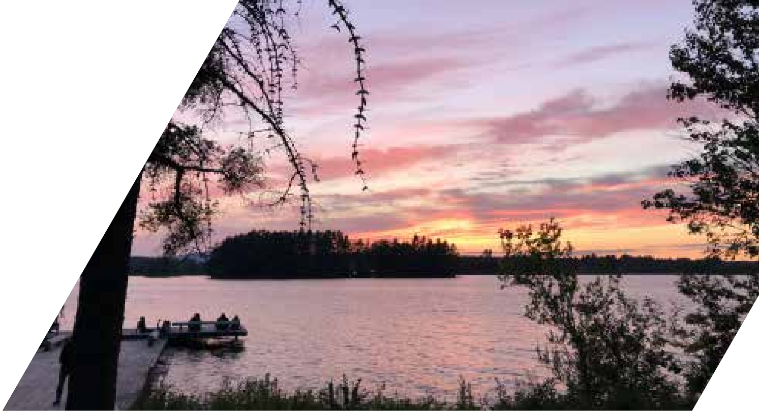
Restoring Our Roots Land-Based Retreat, July 2018.