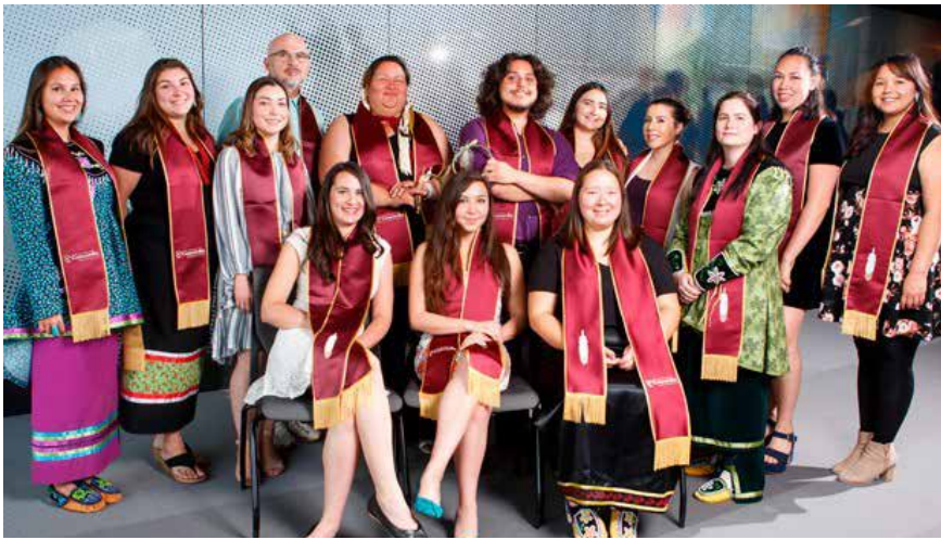
Indigenous student graduates, May 2018