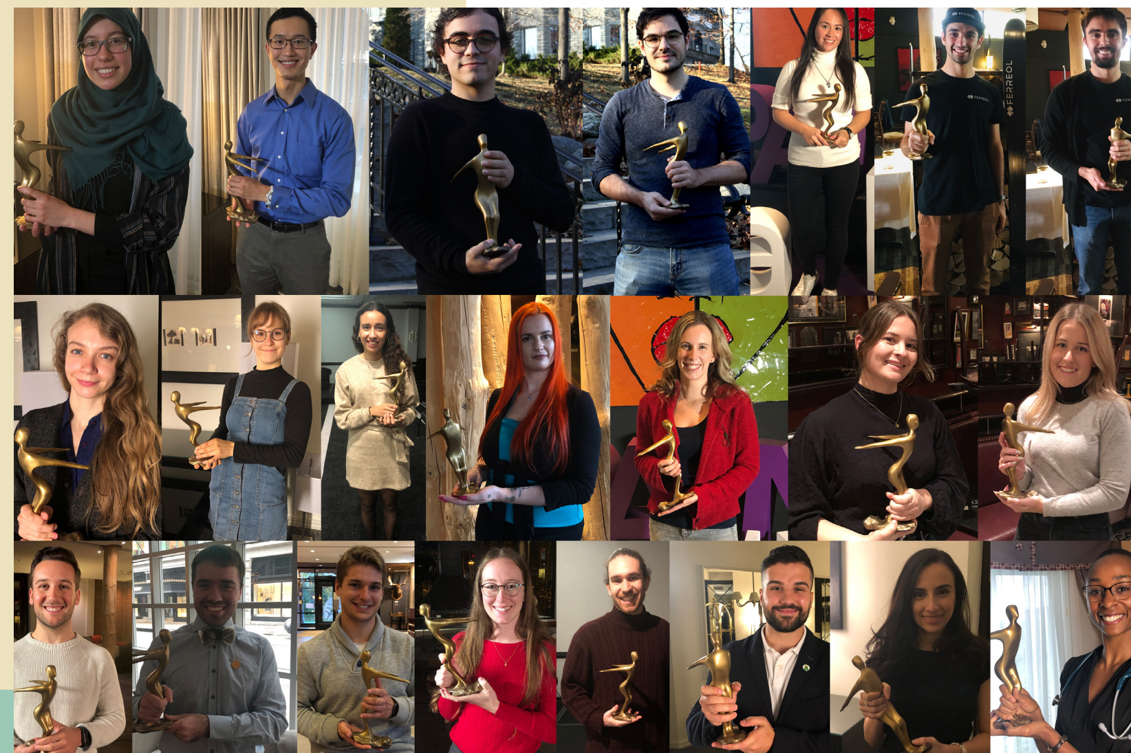
2020 Forces AVENIR University winners