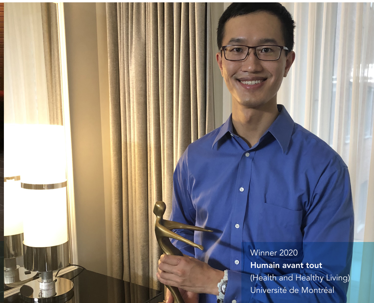
Winner 2020 Humain avant tout (Health and Healthy Living) Université de Montréal