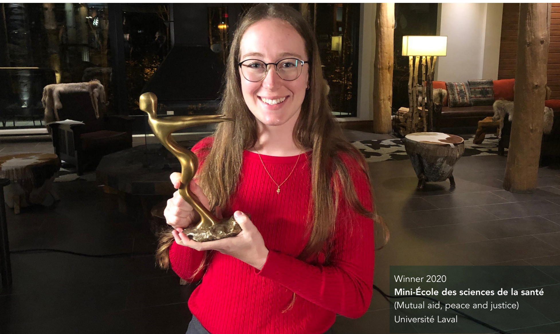
Winner 2020 Mini-École des sciences de la santé (Mutual aid, peace and justice) Université Laval