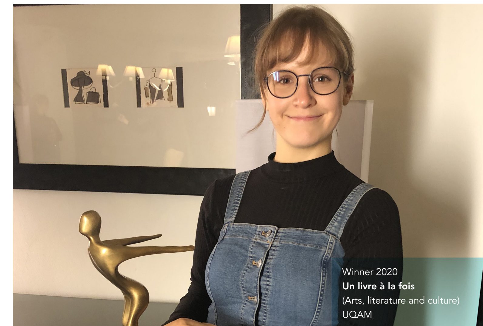
Winner 2020 Un livre à la fois (Arts, literature and culture) UQAM

** MANDATORY SELECTION INTERVIEW: IN ORDER TO SELECT THE FINALISTS AND WINNERS OF EACH CATEGORY, THE GRAND PROJECT AND THE GRAND PERSONALITY JURYS WILL INVITE THE BEST CANDIDATES FROM EACH CATEGORIES TO AN INTERVIEW. INTERVIEWS WILL BE HELD IN MAY OR JUNE, AND THOSE INVITED MUST BE PRESENT, WHETHER IN PERSON, BY PHONE OR BY VIDEOCONFERENCE.