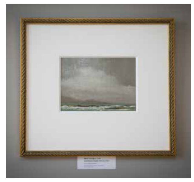
"Connemara Coast," February 2022 (oil on gesso board)