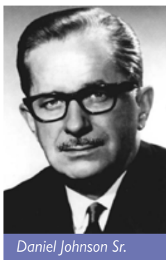
Daniel Johnson Sr.

Arriving long before the waves of famine-stricken immigrants in the 1840s and the 1850s, the Johnsons prospered in Quebec. The first of the famous political dynasty, Daniel Johnson Sr., was born in Sainte-Anne-de-Danville in the Eastern Townships in 1915 to a French-Canadian mother and an Irish father. A passionate nationalist, he entered politics in 1946 to run as a candidate for Maurice Duplessis' Union Nationale and was elected to the National Assembly as the member for the riding of Bagot. Ten years later, he was appointed Minister for Hydraulic Resources. In 1961, he became leader of the Union Nationale and then Premier of Quebec in 1966 after defeating Jean Lesage's Liberal Party.