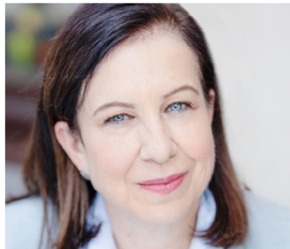
Lyse Doucet, LLD 20 BBC foreign correspondent, host and documentarian

"You will have tremendous opportunity to better our world and I have faith that you will do that with the most brilliant of engineering minds."