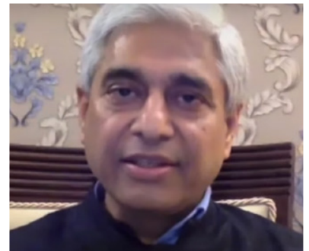
Vikas Swarup, LLD 20 Government of India diplomat and bestselling author

"You have to be armed with the resilience and the resolve to be active. Never mind that the world is in the state it's in. Go out and do your part."