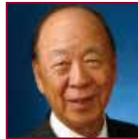
Dr. Che-woo Lui LLD 04, GBM, MBE, JP, Chairman K. Wah Group