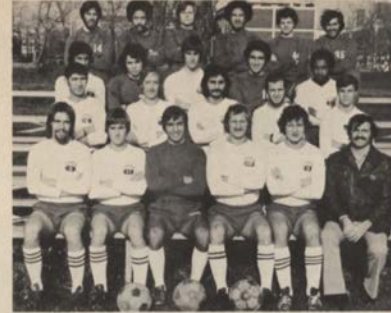
1973 WARRIORS CANADIAN INTERCOLLEGIATE CHAMPIONS