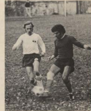
OCKEDAHL USES FANCY FOOTWORK