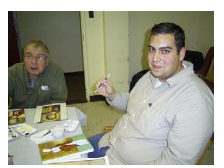
Students painting icons