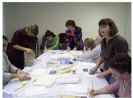
Students preparing the boards

icon, but also addressed theoretical questions such as: How can one understand an icon? How can one discover the elements of theology, aesthetics and technique of painting icons? Just as there are layers of colors in the icon, so there are layers of meanings to be discovered.Below please find some images from the class: