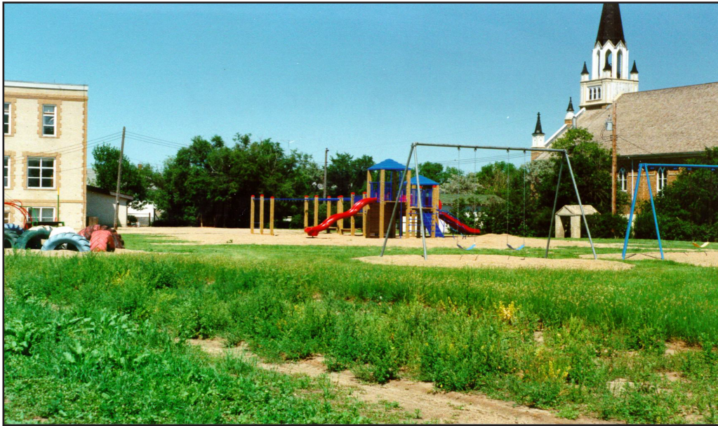
Site 24: Wood River, Saskatchewan

The Rural Municipality of Wood River is a farming region with a population of approximately 986 people. Located on the rolling plains of South central Saskatchewan, it lies 140 km Southeast of Moose Jaw, the closest adjacent large urban center. Although the Wood River area was claimed to be “unsuitable for agriculture” by British explorer John Palliser in 1857, residents in the Northern part of the municipality have survived through grain production. In the South, most of the livelihood comes from either ranching or mixed farming.