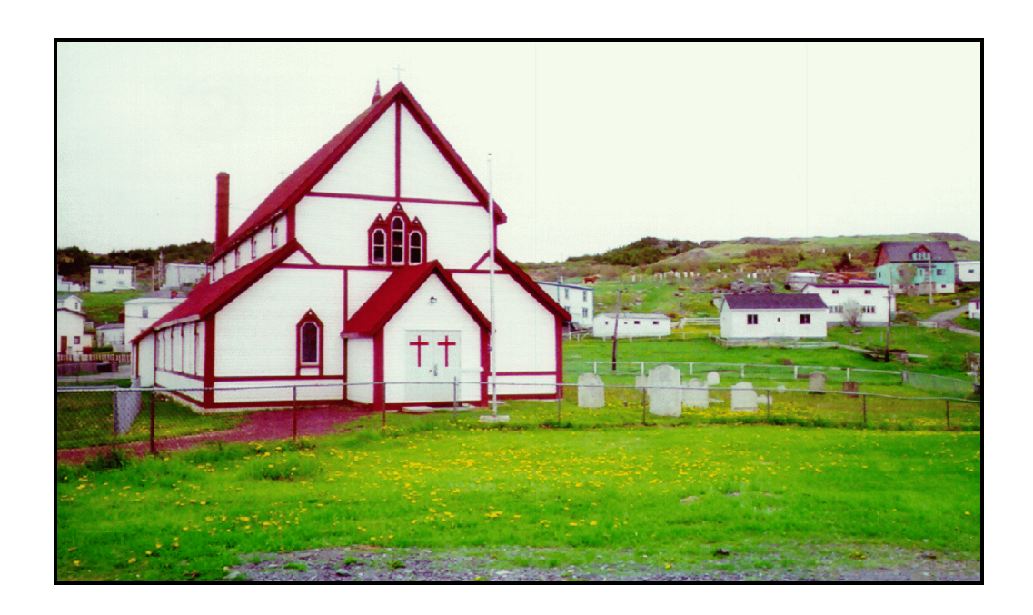
Site 1: Winterton, Newfoundland

Winterton, with a population of 622, is located on Trinity Bay on the Western side of the Avalon Peninsula on Newfoundland's east coast. The area around Winterton was most likely the site of Beothuk settlement long before Europeans first visited. The first recorded European visit to the area was John Guy in 1612. The first census was taken in 1675 and recorded 3 planters, 40 servants, and 8 boats. These settlers were West Country English fishermen from Dorset and Devon. Many surnames of the area originate from migration from this area in the late 17th and 18th centuries. Winterton was originally called Scilly Cove, after the Scilly Isles off Southwestern England. The name was changed to Winterton in 1912, after Sir James Winter, a former Prime