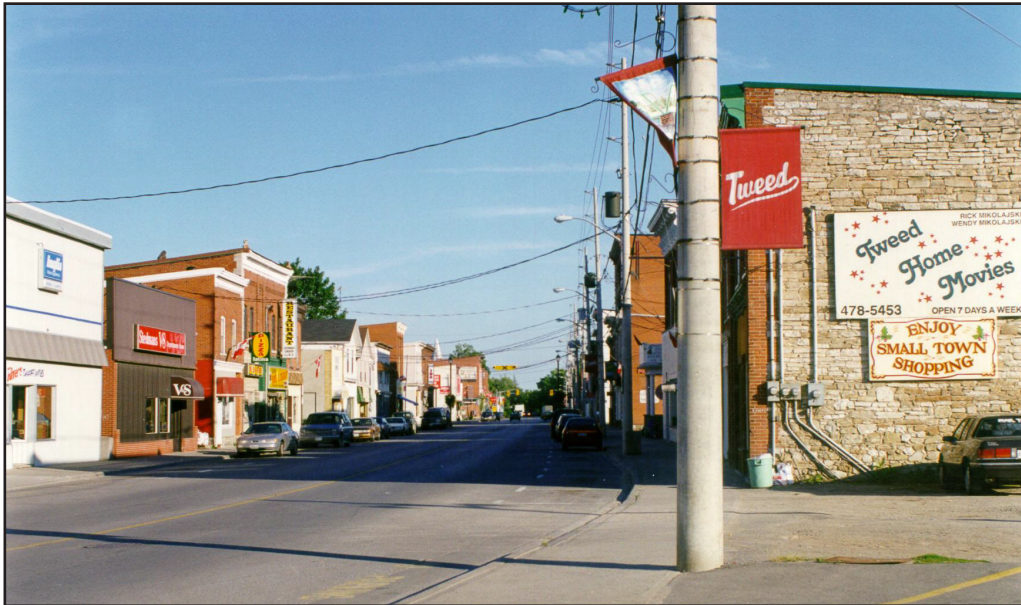
Site 15: Tweed, Ontario

Tweed is a town that had a population of 1,572 in 1996 and is located in Hastings County on a route between Toronto and Ottawa. It acts as a service center for the surrounding farm and rural non-farm community and lies 38km North of Belleville. Tweed's manufacturing industry and public service sectors have declined in the current economy which is mixed, based on tourism and retirement functions as well as retail and agricultural services. Tweed has vibrant and enthusiastic community representatives who are eager to improve economic conditions. Recent changes related to loss of services have created some stress for the community.