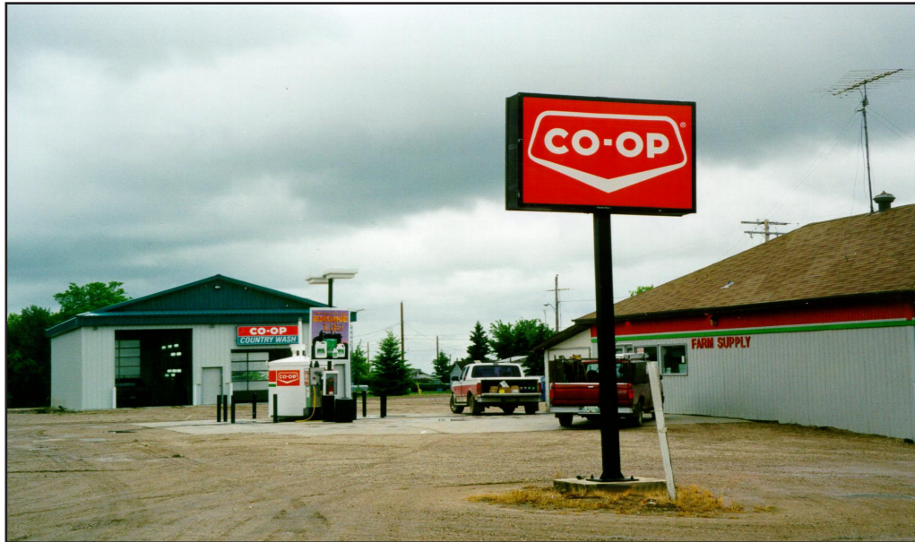
Site 23: Spalding, Saskatchewan

The village of Spalding is located 167 km Northeast of Saskatoon in central Saskatchewan. Spalding has a population of 281 and is a service center for the surrounding Spalding Rural Municipality, with a total population of 1049. The region has highly productive cropland and a historic focus on agriculture.