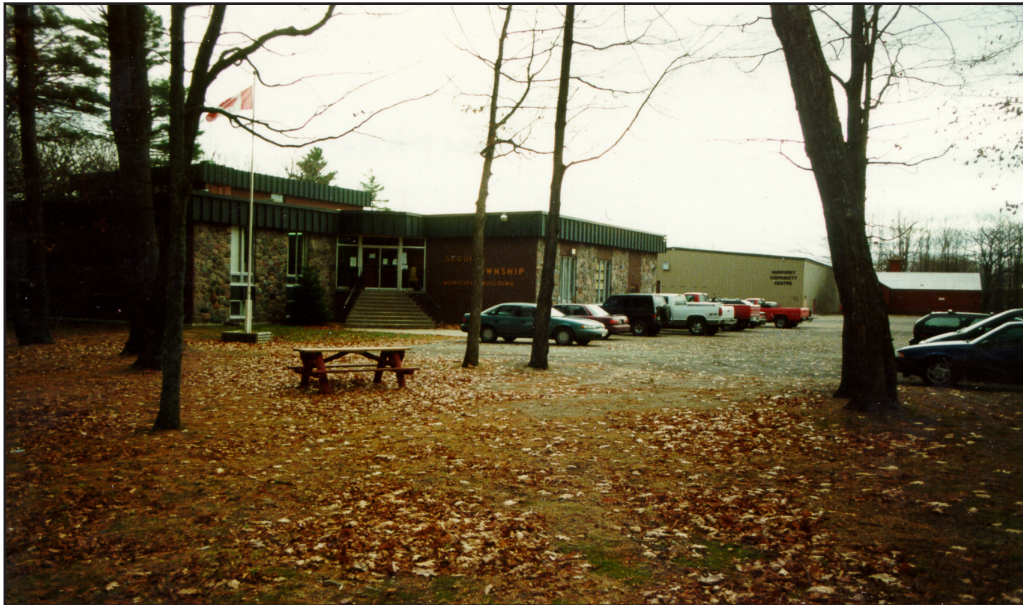
Site 18: Seguin, Ontario

The township of Seguin became a newly incorporated municipality on January 1st, 1998. Seguin is located in Northeastern Ontario; it is an amalgamation of the former townships of Christie, Foley and Humphrey, and the village of Rosseau, annexing the western portion of the unorganized township of Monteith. The township of Seguin is the southernmost township in the District of Parry Sound. The new township of Seguin is approximately 700 square kilometres in size, has small pockets of settlement and a large seasonal population. Seguin's permanent population is about 3,400.