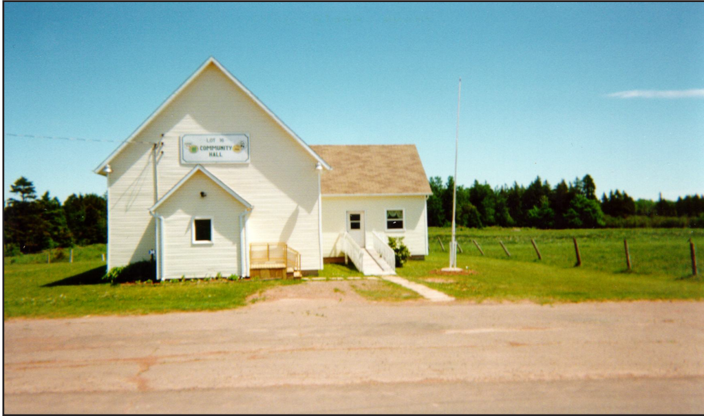
Site 3: Lot 16, Prince-Edward Island

Encompassing the communities of Belmont and Wellington, Lot 16 is an unincorporated area northwest of Summerside, PEI. With the number of year-round residents at about 650 people, Lot 16 has experienced a small population increase as people working at the relatively new GST service centre in nearby Summerside choose to live there and commute to work.