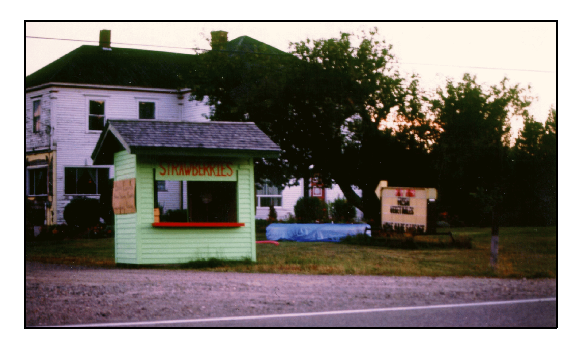
Site 6: Blissfield, New Brunswick

Blissfield is located along the Miramichi River, approximately 5 kilometers north-east of Doaktown, upon which it is dependent for most goods and services. It is an unincorporated parish with fewer than 700 people, built along one of the province's busiest highways, Route 8. The forestry industry is very important. There are four lumber yard sites within a 30 kilometer distance of the Blissfield centroid. The two most dominant have been the Blissfield Lumber Yard, owned and operated by Glen Gilks, a resident of Blissfield; and the Russell and Slim Mill that has undergone numerous rebuilding efforts and that was recently purchased by the Irving Company of New Brunswick. The arrival of Irving to Blissfield was not one that was accepted by all of the residents in the beginning. The purchase was