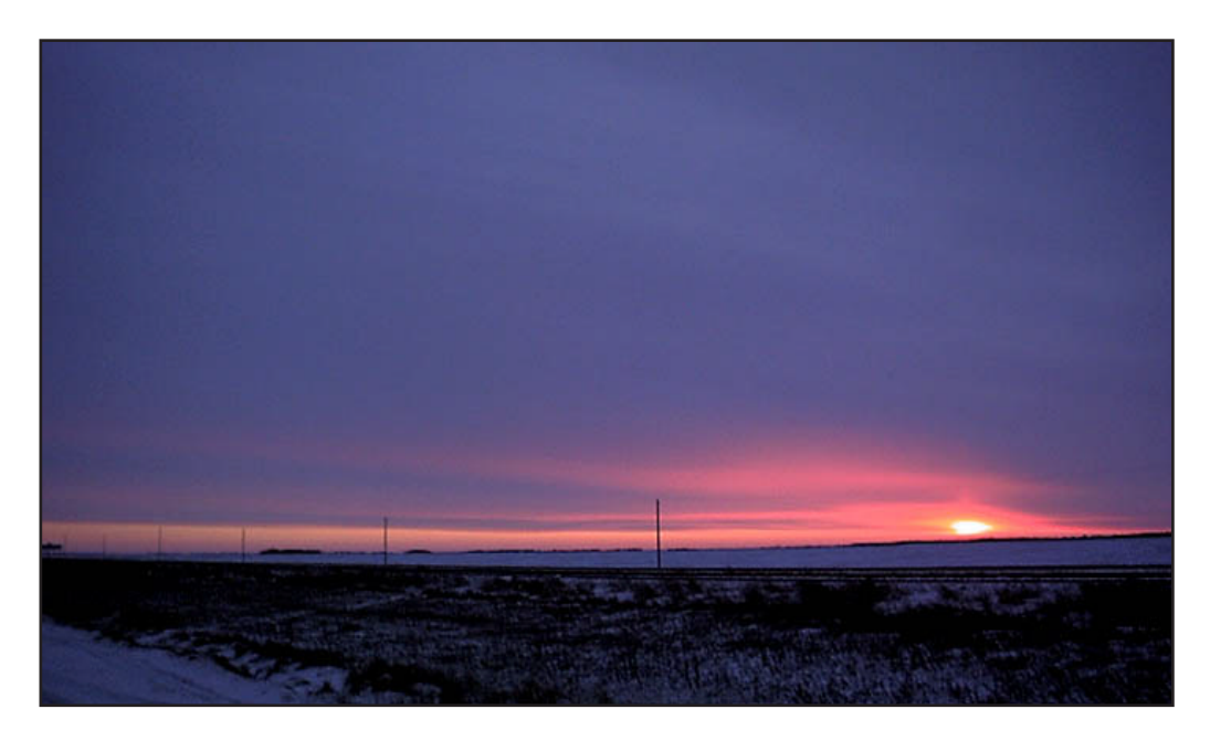
Site 21: Benito, Manitoba

Located in Southwestern Manitoba, Benito sits in the Swan River Valley, adjacent to the Saskatchewan border and 474 km northwest of Winnipeg. With a population of 460, the community is known primarily as a farming service center as well as a health service provider because of the local hospital.