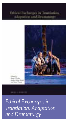
Ethical Exchanges in Translation, Adaptation and Dramaturgy