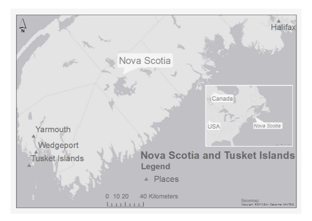
Figure 1 – Nova Scotia and the Tusket islands (map by Nicole Leslie, 2014)

One micronation, The Principality of Outer Baldonia, pre-dates modern examples by several decades. Established off the south shore of Nova Scotia, Canada by an American businessman in the 1940s, Hayward describes this principality as "the clearest precursor to contemporary micronations" (2014: 6). This paper explores the creation of Outer Baldonia and the actions of its creator as indicative of a broader social performance. This analytical framework might also be useful in the examination of modern micronations. Performances, according to Deborah Kapchan, "are aesthetic practices... whose repetitions situate actors in time and space, structuring individual and group identities" (1995: 479). The development of a micronation presents an opportunity for a number of social meanings to be performed; the history of Outer Baldonia reveals much about contemporary attitudes among North American elites towards nature and wilderness, as well as political sovereignty and diplomacy. These themes are examined within the contexts of the Atlantic Canadian tourism industry in the mid-20th Century, and draw upon international media representations of Outer Baldonia and its creator.