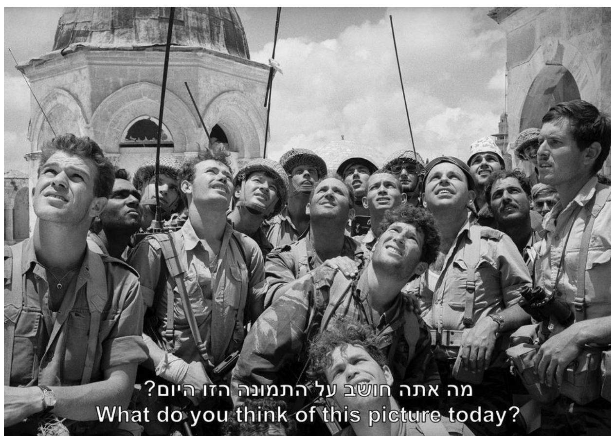
A still image from The Last Photograph exhibition, courtesy of the Tel Aviv Museum of Art (https://www.tamuseum.org.il/en/exhibition/last-photograph-ran-tal-after-micha-bar-am/)