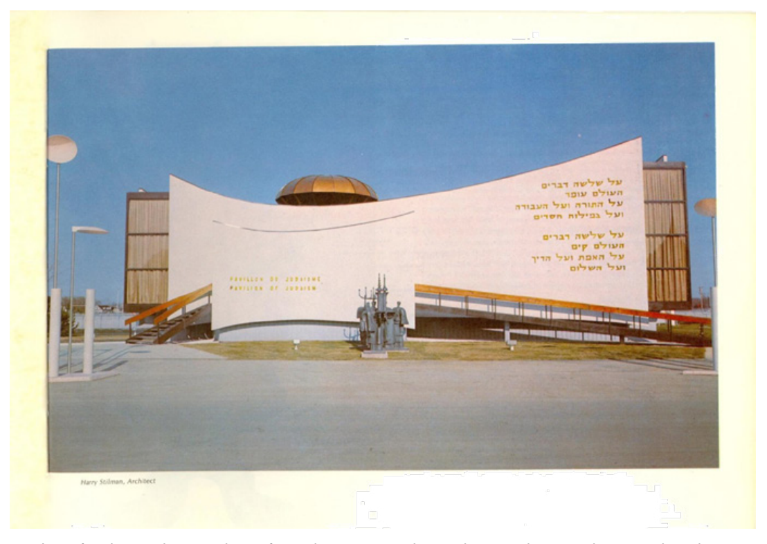
Pavilion of Judaism. The Foundation for Judaism, 1967.