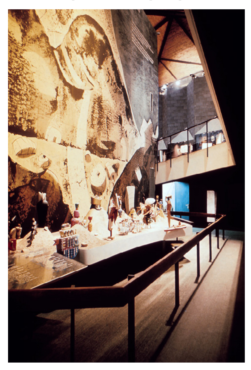
The Beauty of Israel display, featuring sculptures by Ruth Zarfati and behind, The Desolate Land , mural by Shraga Weil. Ruth Zarfati (sculpture installation); Shraga Weil (wall mural); Dov Segal (interior architect), 1967.

explicit; the viewer through their visit participates in a journey home in this ancestral biblical connection to this land. For the designers, only a work of art rather than a photograph had the creative power to convey this message. Furthermore, a painting could symbolize a whole land, whereas a photograph could only be directly connected to a specific location, despite its possible abstraction through framing.