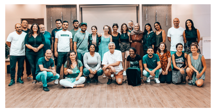
Students from the Azrieli Institute and Western Galilee College explored the deeper meanings of multiculturalism and intersectionality