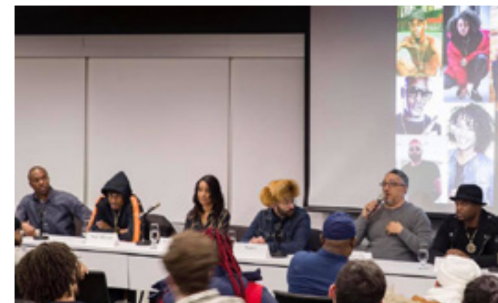
Hip Hop Town Hall Conference, Youth Stars Foundation.