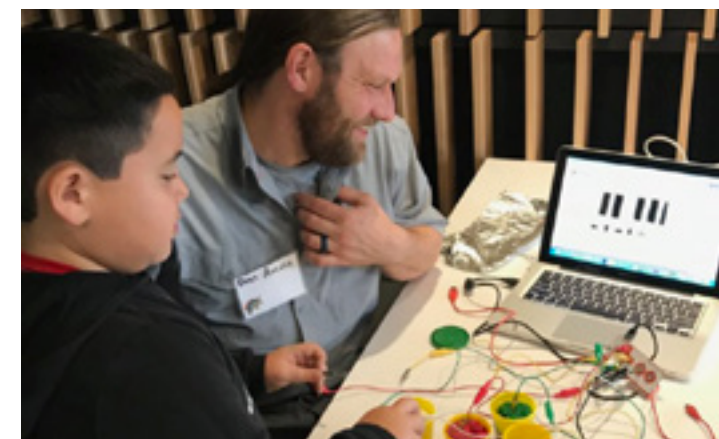
Remix Ed Unconference, LEARN Quebec.