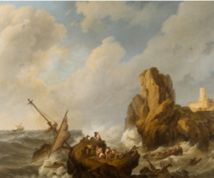
Johannes Hermanus Koekkoek, Storm at Sea .

The Max Stern Art Restitution website was created to help further research and to track the development of the project and recovery. concordia.ca/arts/max-stern