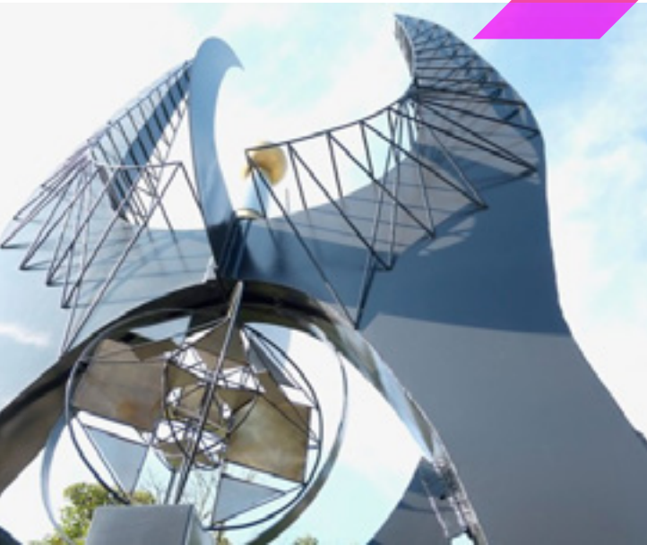
The kinetic sculpture by Walter Fuhrer called Transcendance is one of 20 artworks commissioned by the House of Seagram for the Expo 67 World's Fair and was donated to Loyola College in 1968. It was recently completely restored, including the rotating centre sphere, which is functional between May and November.

To see our entire collection online and plan your visit, consult our Public Art website at concordia.ca/arts/public-art . For a city-guided tour see Art Public Montreal ( artpublicmontreal.ca ). Take the Montreal, City of Culture and Knowledge tour in the Golden Square Mile and its museums.