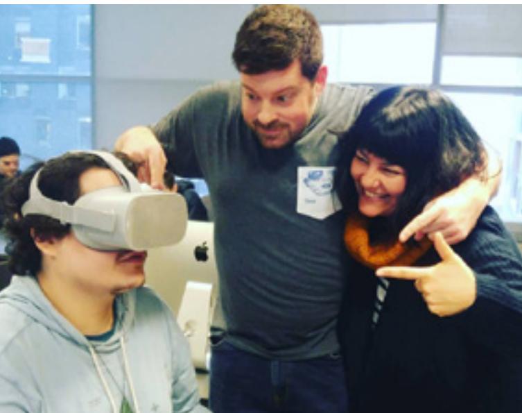
Uhu Labos Nomades Creative Spirit workshop.