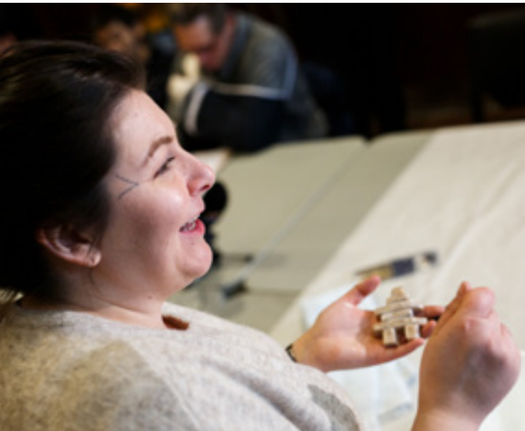
Inuit carving during First Voices Week.