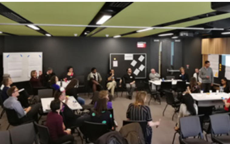
Shift Centre for Social Transformation Design Session Consultation.