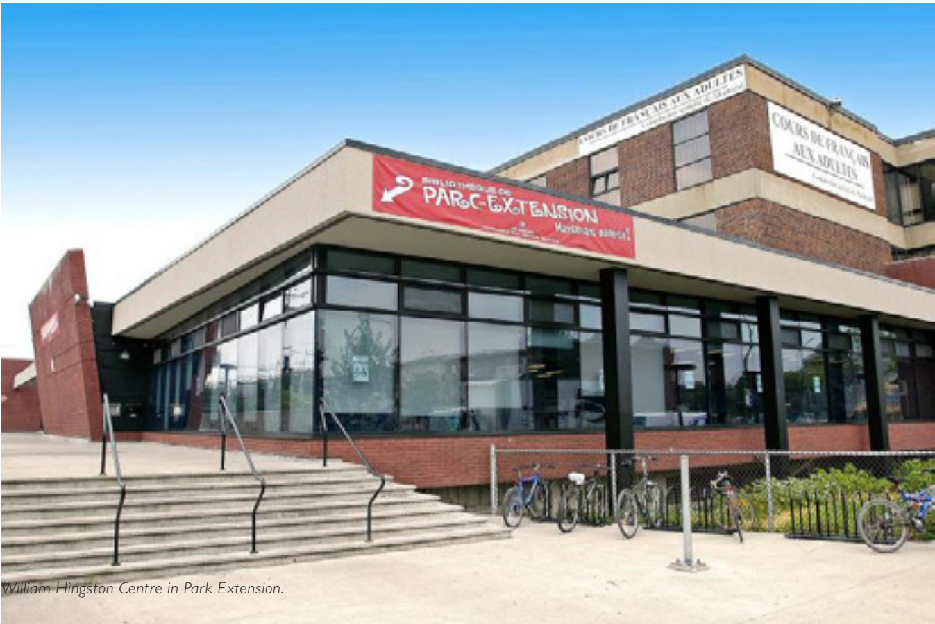
William Hingston Centre in Park Extension.