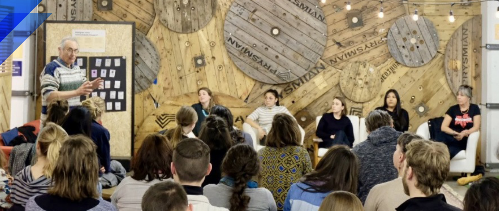
Launch of the Indigenous Ally Toolkit.