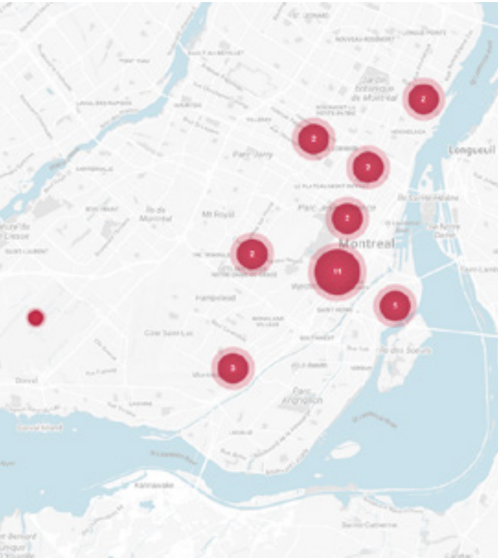
Screen shot of Embrace the City Map.