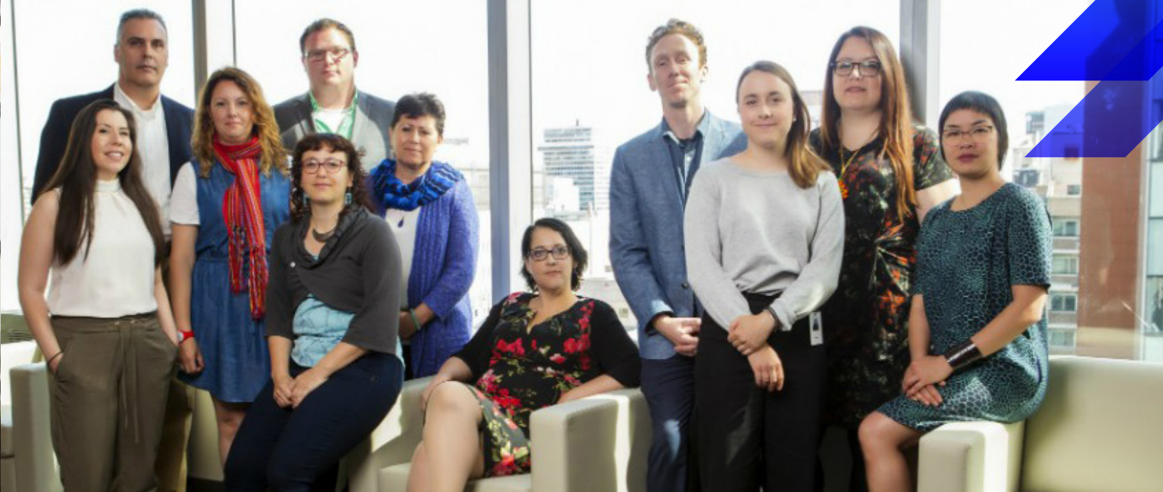
Members of the Indigenous Directions Leadership Group.