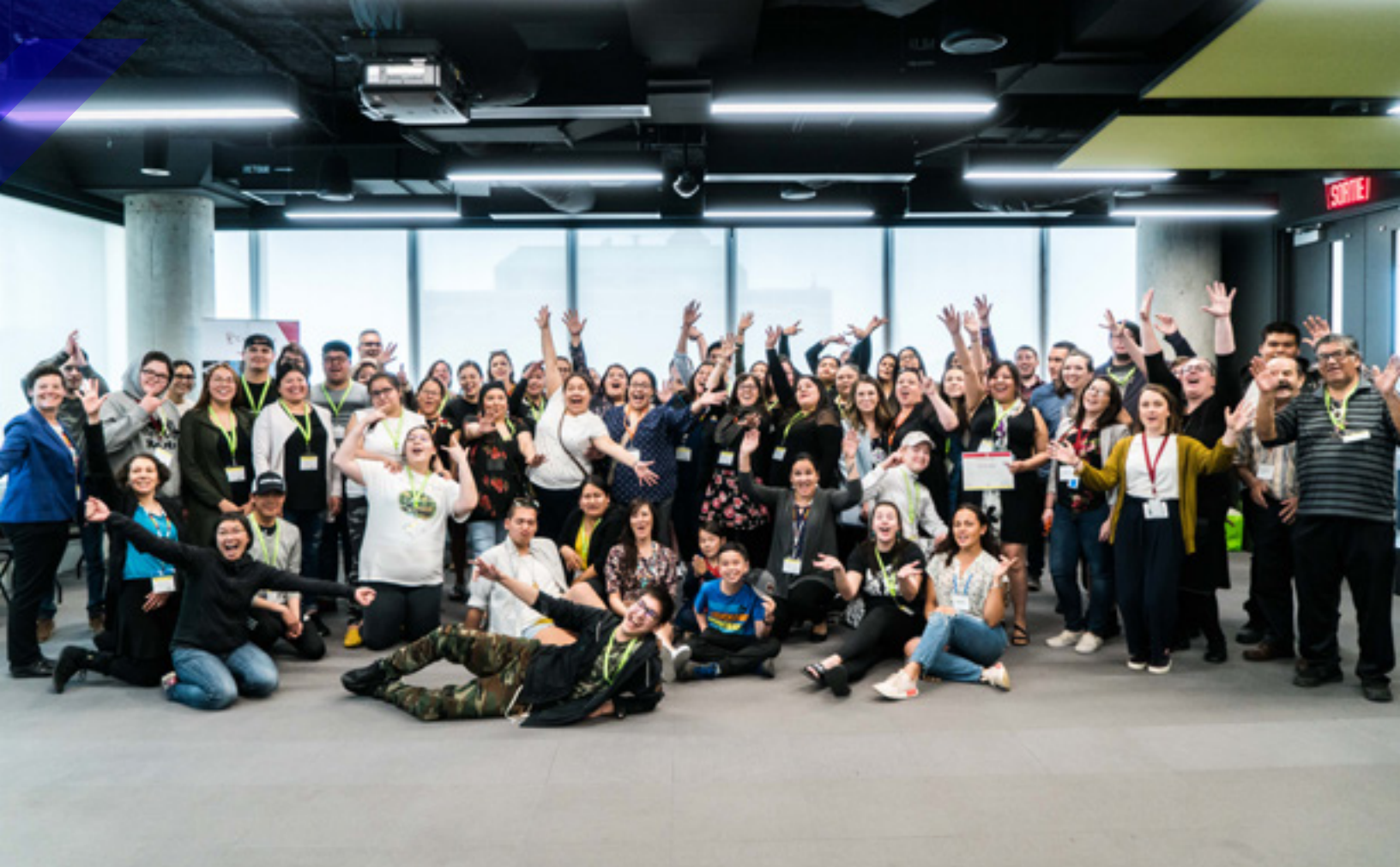
StartUP Nations Participants.