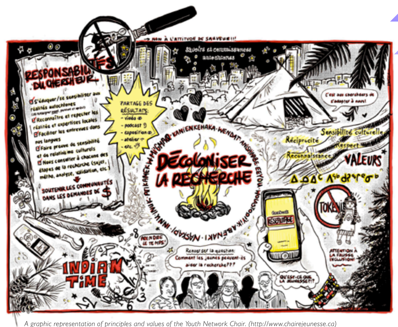
A graphic representation of principles and values of the Youth Network Chair. ( http://www.chairejeunesse.ca )