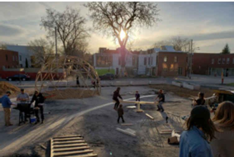
Hangin' out in front of Bâtiment 7.

The OCE has been instrumental in facilitating the introduction of a broad range of initiatives on site, including the recruitment of new projects into the Bâtiment 7 ecosystem such as the Tiger Lotus Co-op, a cooperative of alternative health practitioners, and Abjad Howse, which supports the emergence of Montreal artists of Arabic descent.