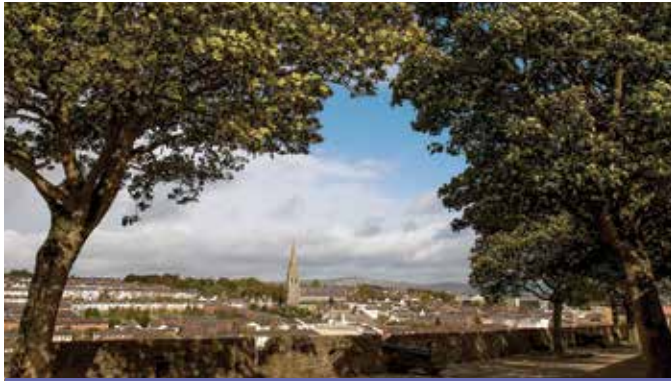
Derry, Northern Ireland

"Please accept my sincerest thanks for selecting me as the recipient of a CAIS 2017 conference scholarship. This generous gift allowed me to experience, for the first time, a coming together of Irish studies scholars from across the globe and to take part in the celebration and exploration of links between Canada and Ireland.