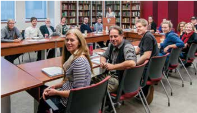
Graduate students in the School of Irish Studies' Father Thomas McEntee Reading Room.

Supported in part by generous financial assistance from the Canadian Irish Studies Foundation, Concordia welcomed five new graduate students — three MA and two PhD students — in fall 2017.