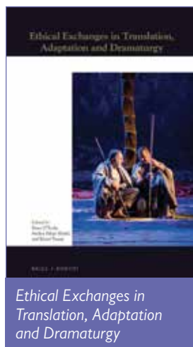
Ethical Exchanges in Translation, Adaptation and Dramaturgy