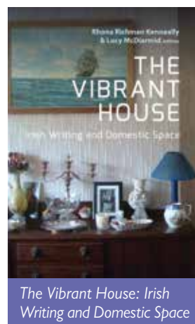
The Vibrant House: Irish Writing and Domestic Space