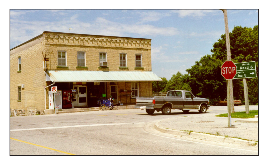
Site 17: Usborne, Ontario

Usborne, which had a population of 1,535 in 1996, is a former township now part of the Municipality of South Huron, Huron County and is dominated physically by a commercial farm landscape. Cash-crop and livestock operations had a total value $34 million in sales in 1996 and provided employment for 40% of the workforce (one of the highest shares reported in the province and in Canada). There is no town or village of any size in the township; most residents rely on the adjacent town of Exeter for service and some retail needs. Usborne's population is dispersed in farm and non-farm households.