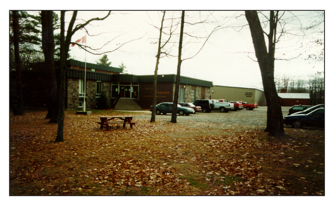
Site 18: Seguin, Ontario

The township of Seguin became a newly incorporated municipality on January 1st, 1998. Seguin is located in Northeastern Ontario; it is an amalgamation of the former townships of Christie, Foley and Humphrey, and the village of Rosseau, annexing the western portion of the unorganized township of Monteith. The township of Seguin is the southernmost township in the District of Parry Sound. The new township of Seguin is approximately 700 square kilometres in size, has small pockets of settlement and a large seasonal population. Seguin's permanent population is about 3,400.