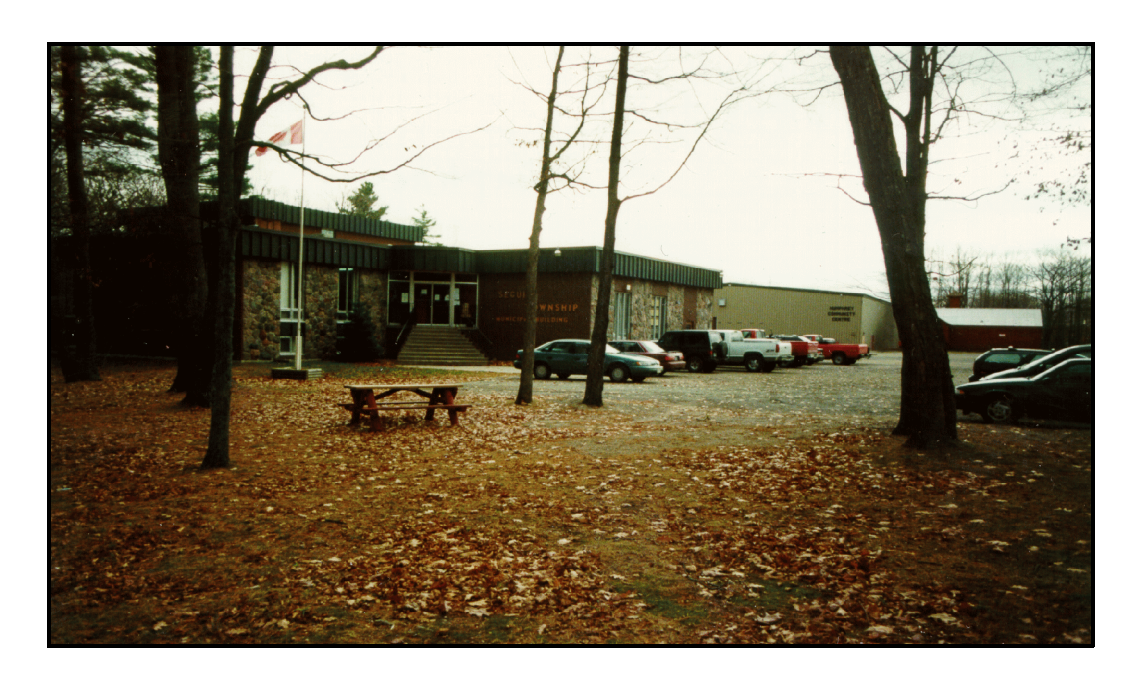
Site 18: Humphrey, Ontario

Humphrey is located in Northwestern Ontario and has a population of 1,194. There is a hamlet named Humphrey which collects some of the year-round residents, but 75% of Humphrey's population is comprised of summer residents who live in cottages on lakes. Fishing, boating, tourism, and especially cottages are the main industries. The lakes and shorelines make this the most important industry. This township has some of the highest priced real-estate in Northern Ontario.