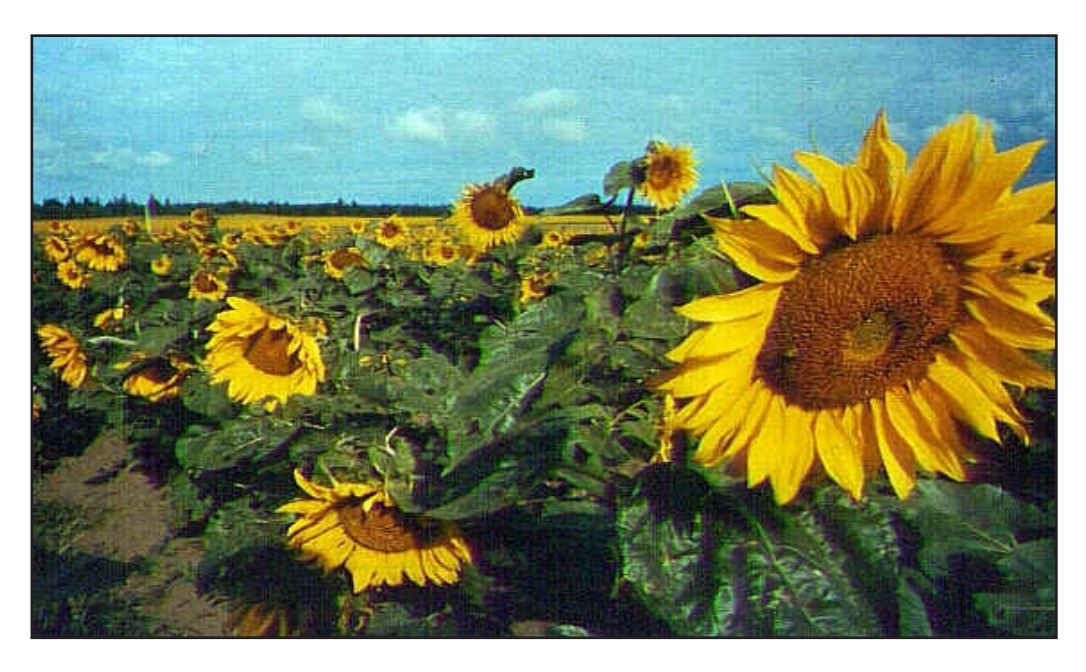
Site 20: Rhineland, Manitoba

Rhineland is a rural municipality situated close to the American border in the Red River Valley of Southern Manitoba. With a population of about 4200 people, Rhineland is actually a clustering of several rural communities in the area. The closest urban centre, Winnipeg, is found approximately 100 km Northeast of the area. The population of Rhineland makes use of surrounding towns Altona and Winkler for its services.