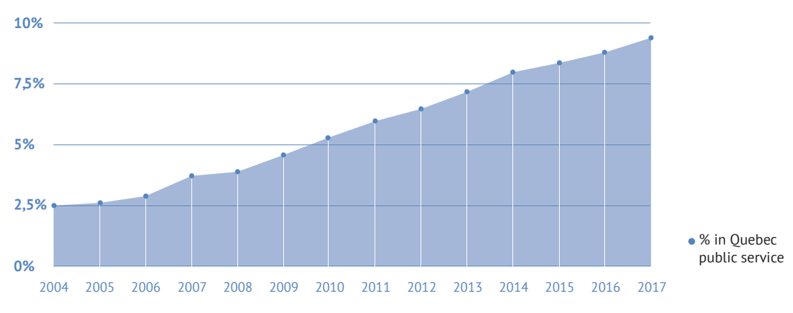
Fig. 2: Proportion of cultural communities within the QPS