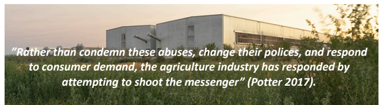
Figure 5: A part of the series ‘Censored Landscapes’ by Isabella La Rocca González. 600,000 egg-laying hens are captive 11 .