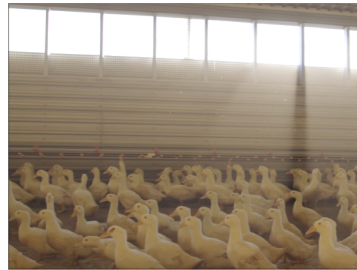
Figure 1: A snapshot from King Cole's Duck Farm in Whitchurch-Stouffville, Ontario 9

In the past year concerned Canadian’s have organized several farm occupation’s with various demands such as the media be invited to tour the facility or animals be liberated. Each non-violent action was connected by the goal to expose the AAI to the public with the intention to “indict the entire [food] system as one that is based on acts of cruelty and unsafe practices” 5 . Figures (1-4) exemplify the battle over how animal agriculture is visualized. The Canadian government has responded by introducing ag-gag laws. Table (1) provides a brief introduction of the 3-current ag-gag laws.