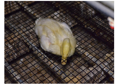
Figure 2: Photo taken from inside the King Cole Duck Farm on February 18 th , 2020.