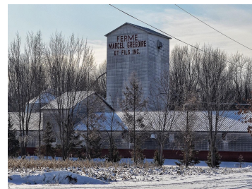
Figure 3: Porgreg Farm in Saint-Hyacinthe, Quebec.