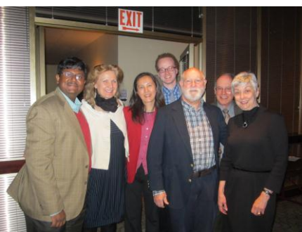
10 th Concordia-Siena Conference p. 4