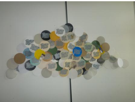
Art Exhibit at LCDS p. 2