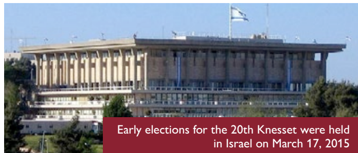
Early elections for the 20th Knesset were held in Israel on March 17, 2015

• May 5, 2015 — The Azrieli Institute organized a roundtable on the 2015 Israel elections and their aftermath. The discussion focused on political parties, stability and the peace process. Guest speakers included: