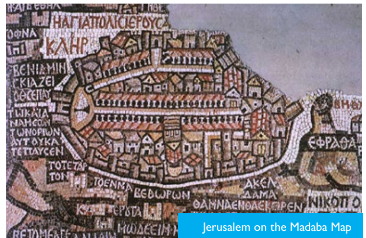
Jerusalem on the Madaba Map