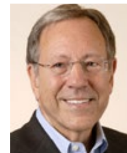
Hon. Irwin Cotler

The conference featured a keynote address from former attorney general of Canada Irwin Cotler, who was