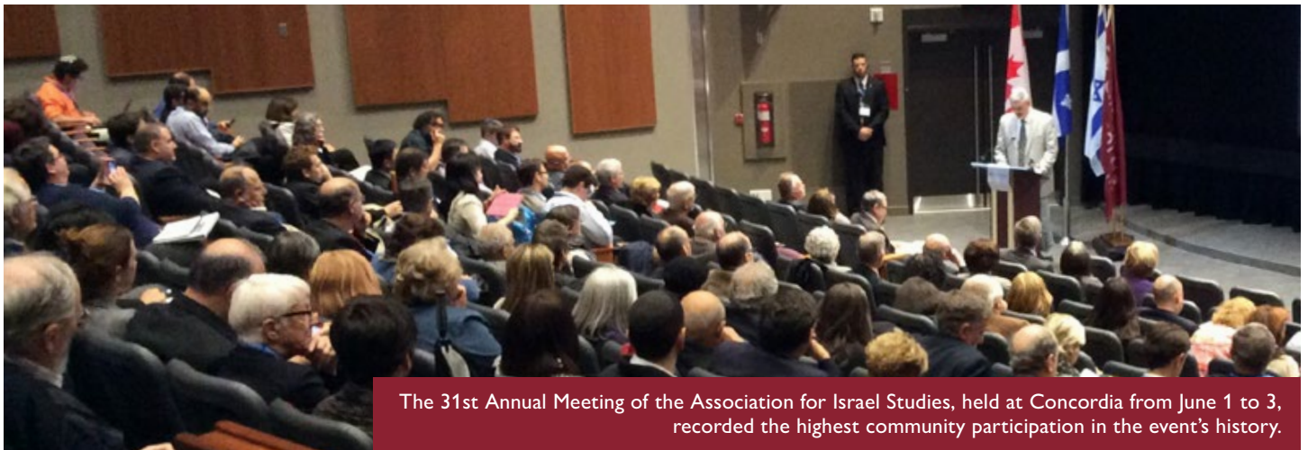
The 31st Annual Meeting of the Association for Israel Studies, held at Concordia from June 1 to 3, recorded the highest community participation in the event's history.