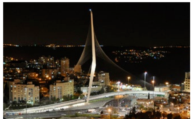
Jerusalem, a city reflecting the fervour and piety of multiple faiths

The study of modern Israel is a significant focus of the program but other time periods are explored. Students gain proficiency in either Hebrew or Arabic: a student with prior Hebrew proficiency enrolls in Arabic language classes while students with Arabic proficiency take Hebrew. Students of the program may also take advantage of the option for intensive study in Israel. To learn more, visit concordia.ca/azrieli .