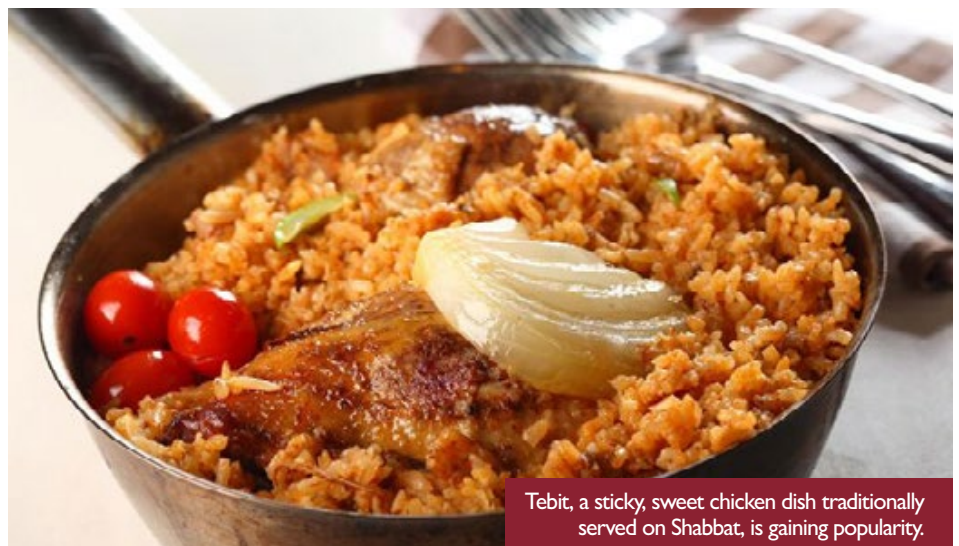
Tebit, a sticky, sweet chicken dish traditionally served on Shabbat, is gaining popularity.

I teach a class on food and religion that looks at all different religious traditions and themes related to food: How do you celebrate using food? What is the symbolism of food? What kinds of spiritual issues can we explore through food? What does food bring to the fore in terms of religious practice and gender?