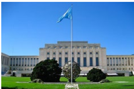
United Nations Office at Geneva